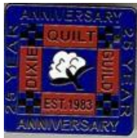
25 th Dixie Quilt Guild Pin