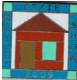
2009 Quilt Show Pin

The Guild held their second quilt show plus celebrated their 25 th anniversary on April 10-11 at the Dixie Center.