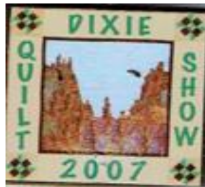
2007 Quilt Show Pin

The Guild hosted its first quilt show called the Festival of Fabric Arts on April 6-7 at the Dixie Center.